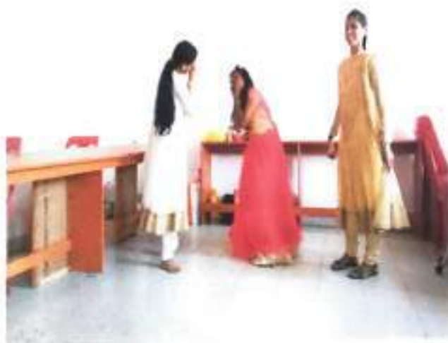
Photo of the play presented by our students on this day